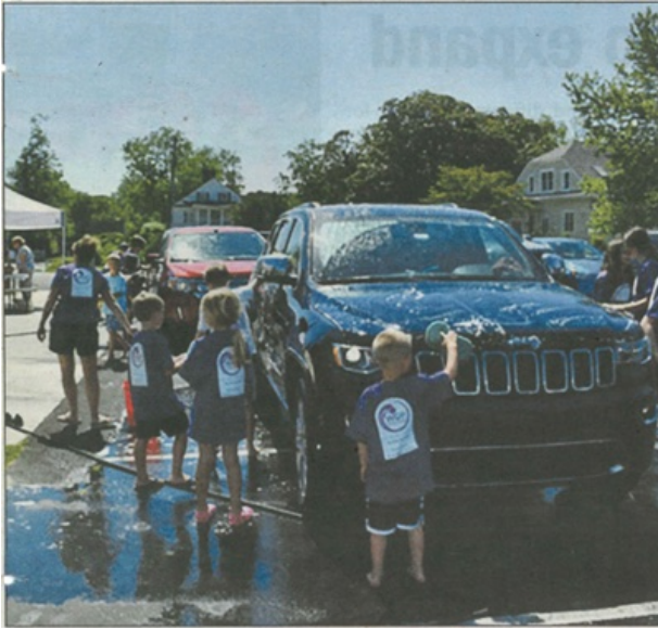
Participants in Temple Bat Yam's Mitzvah Day car wash are shown at Buckingham Presbyterian Church. The event raised social awareness and over $600 for Worcester Goes Purple.