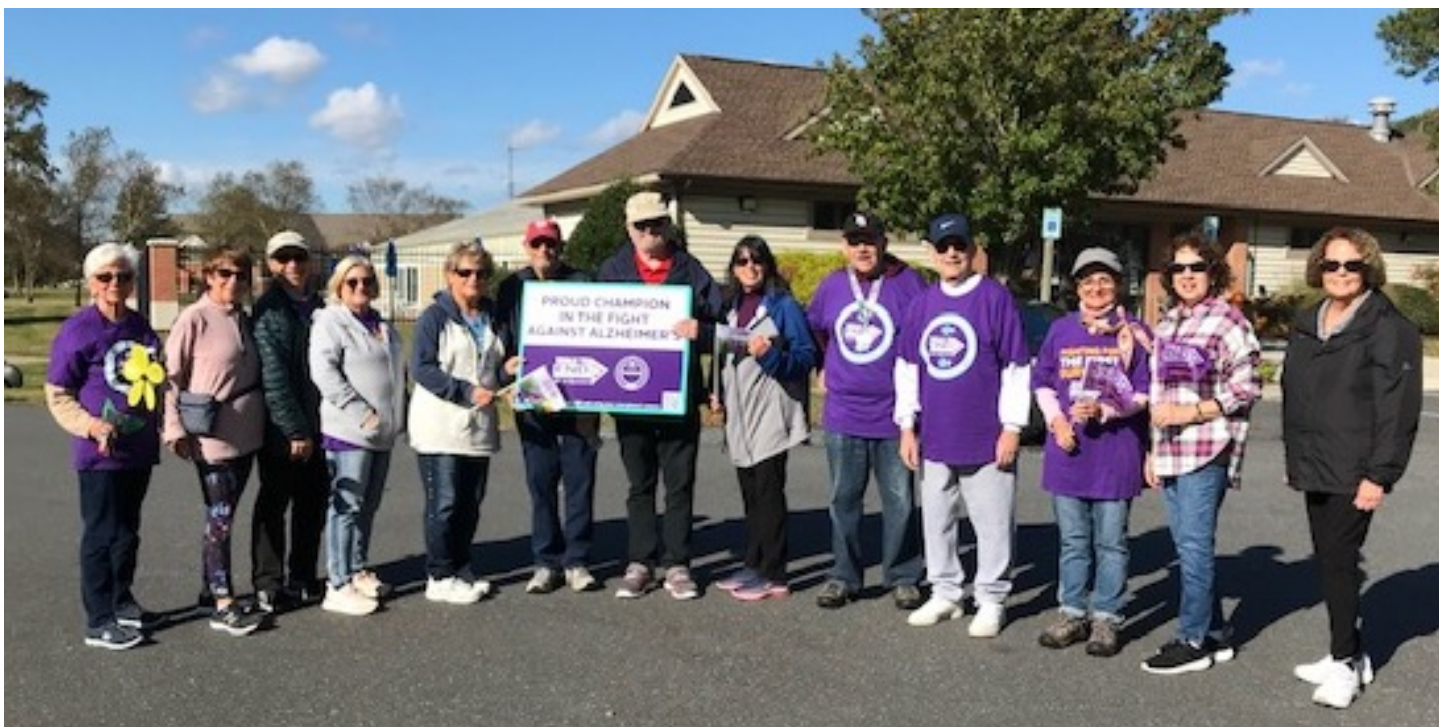
Team TBY at 2021 Walk for Alzheimer's Held on October 30