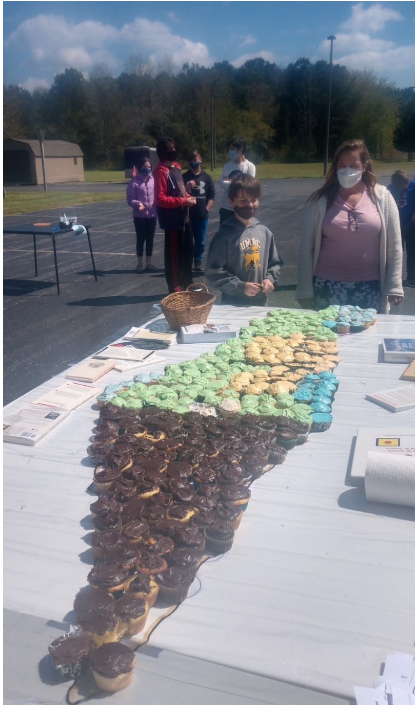
Sunday School students make a map of Israel from cupcakes.