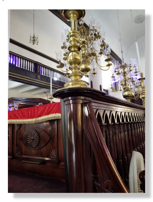
Detail of the Bimah

organist, and about 25 other congregants of diverse ethnic heritage gave us a warm welcome and a meaningful Shabbat.