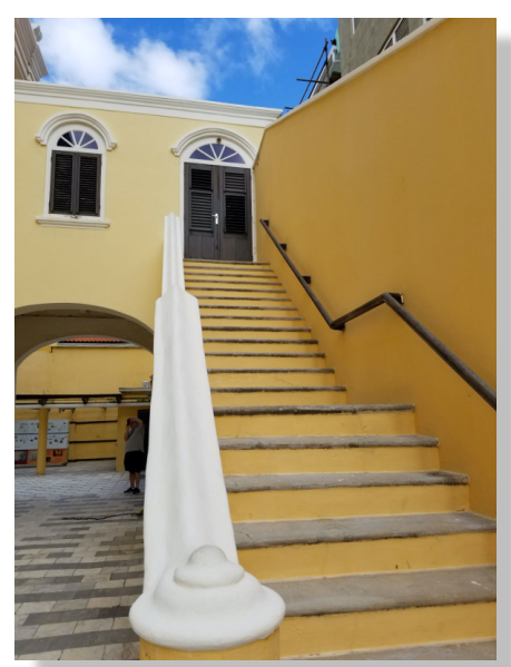
Stairs leading to the women's section.