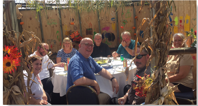
CURE in the Sukkot