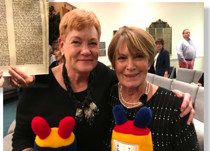
Members and special attendees celebrated this joyous holiday of Jewish love of Torah and study. They celebrated by taking all the Torah scrolls from the ark and spent the evening rejoicing.