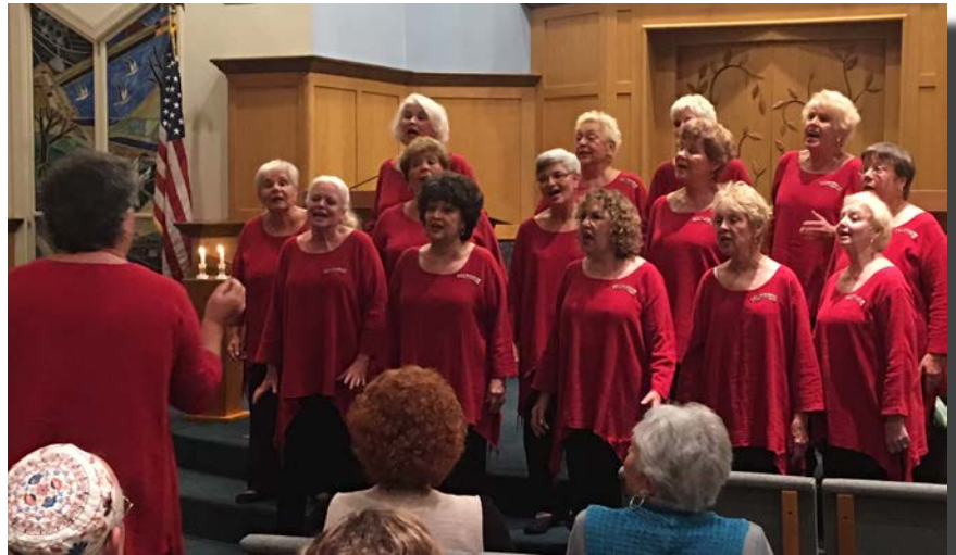
Delmarva Chorus performance

how to keep our balance as we age and what we can do to prevent falls. We will have a "general meeting" and a dairy pot luck dinner before the program. Please note this program is for Sisterhood Members only.